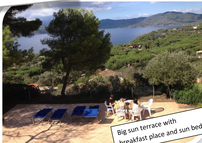
Big sun terrace with breakfast place and sun beds