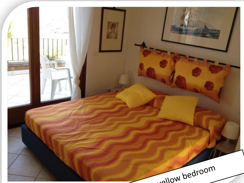
The yellow bedroom