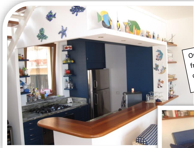
Open kitchen with gas stove, fridge-freezer-combi, dishwasher, automatic coffeemaker