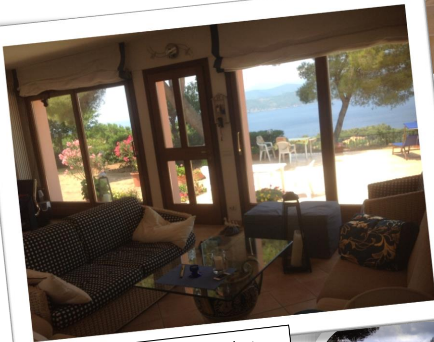
Livingroom with ocean view