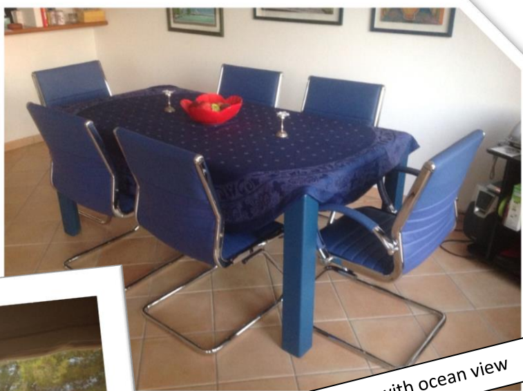
Dining area with ocean view