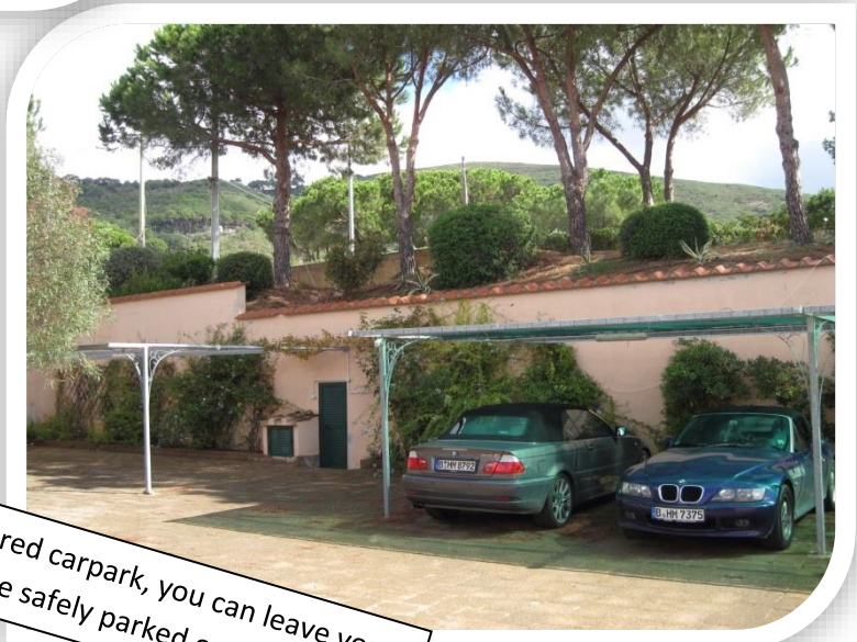
Covered carpark, you can leave your vehicle safely parked on our grounds